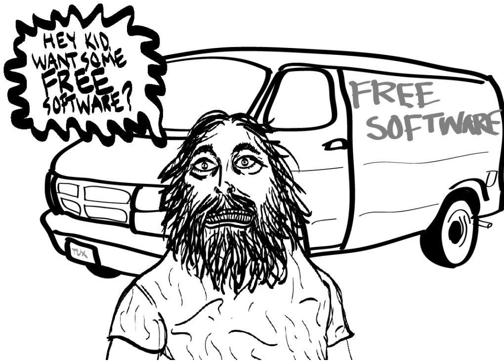
Figure 1: The GNU GPL Explained