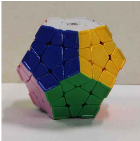
(a) Megaminx in START position